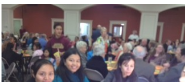
November 30 - Talent Share