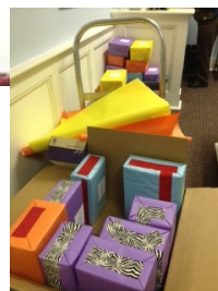
Early December - Student Care Packages