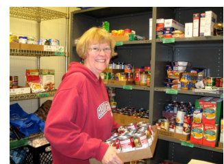
December 17- Delivering Canned Goods to UCHM