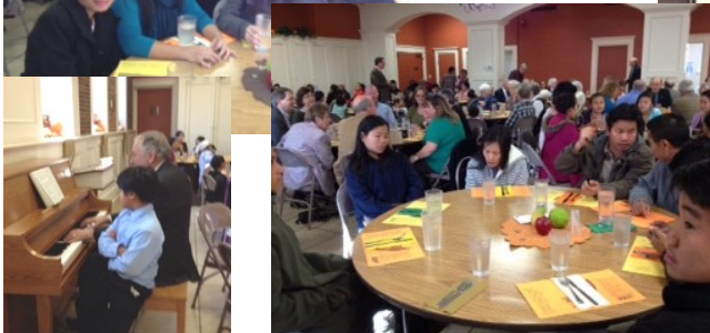
November 18 - Thanksgiving Dinner